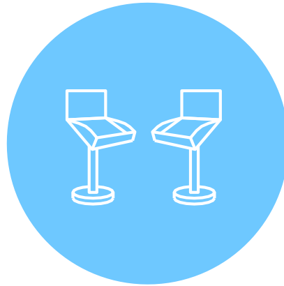
2 HIGH CHAIRS