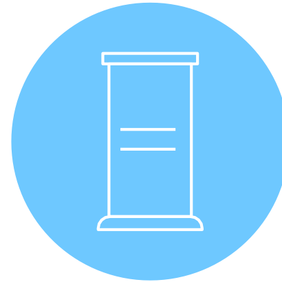
SPACE FOR 1-2 ROLL-UPS (provided by the exhibitor)