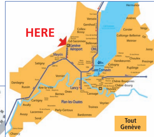
Geneva access - Public transport

You can get the free ticket from the automatic distributor, located in the baggage claim area, just before going through customs. It is valid for 80 minutes and is available to arriving passengers only.